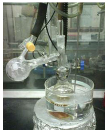
DMSO being distilled

When you use liquid DMSO in the skin, let it dry for over 20 to 30 minutes before wiping the rest out. The skin must be clean, dry, and unbroken for any topical use of DMSO. The face and the neck are more sensitive to DMSO and no higher concentrations than 50% should be applied there. Topical concentrations of DMSO should be kept below 70% in areas where there is a reduction of circulation. When 60 to 90% DMSO is applied to the skin, warmth, redness, itching, and sometimes local hives may occur. This usually disappears within a couple of hours and using natural aloe vera, gel or cream, will help counteract or prevent this effect. When 60 to 90% DMSO is applied to the palm on the hand, the skin may wrinkle and stay that way for several days.